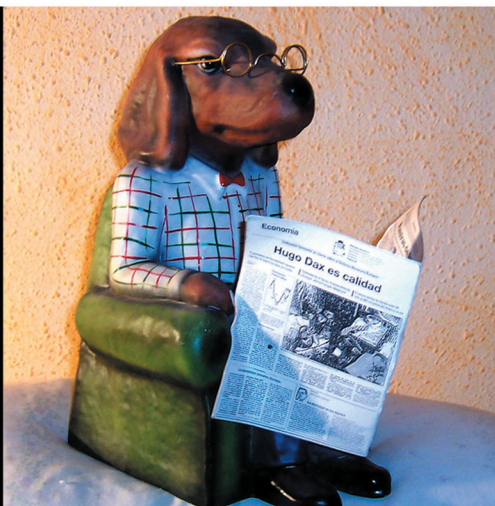
Promotional figure, Hugo Dax