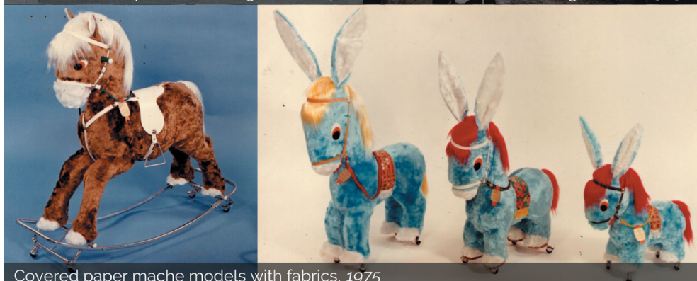
Covered paper mache models with fabrics, 1975