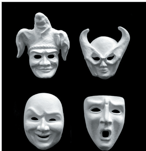
Venetian masks, Arlequí Màscares