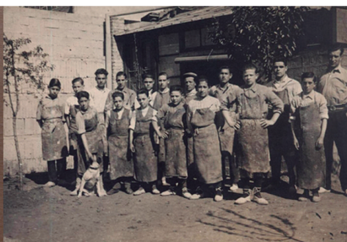
Cal Penas factory, 1925