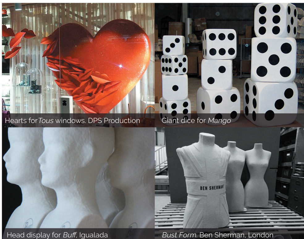
Hearts for Tous windows.