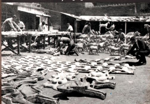
Salvador Cardellach factory, 1920