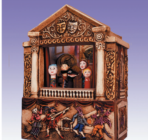
Paper mache theater and puppets